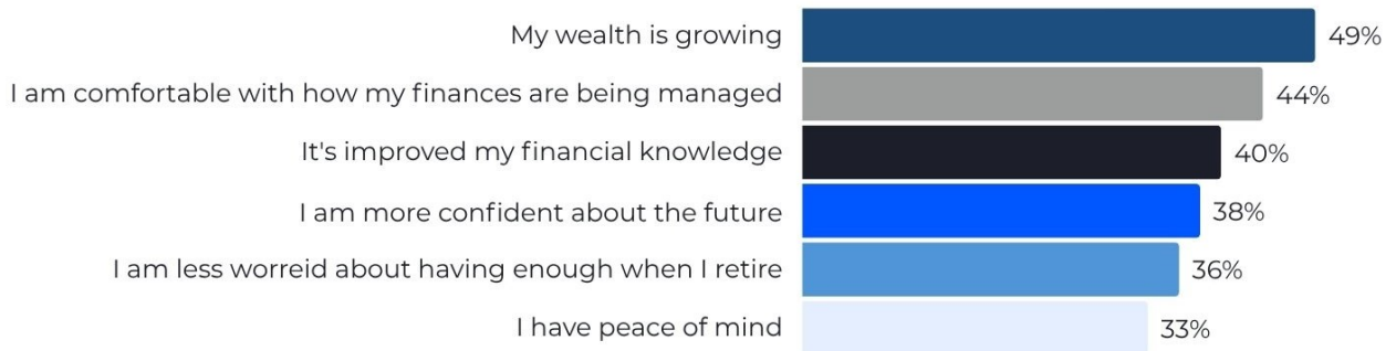
Source: Perpetual Private, (2025) 'What do you care about survey' project

As we looked closer at these benefits we also identified that they form a kind of 'virtuous circle'. Emotional benefits like confidence and comfort reinforce practical outcomes like financial progress and knowledge. And when these elements work in tandem, financial wellbeing is not just improved - it's sustained.